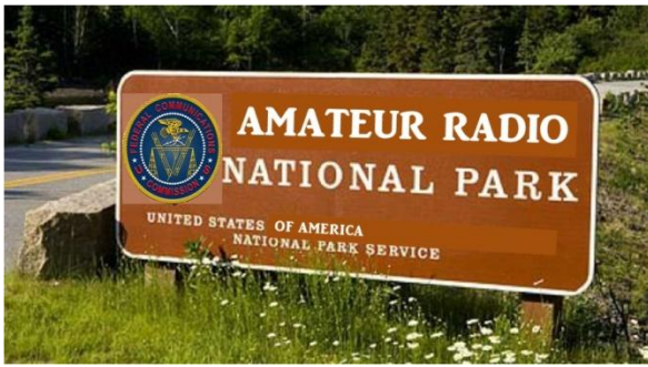
Information sources: Wikipedia and personal frequency allocation database analysis.

What's it "cost" to enter our Amateur Radio National Parks? Merely proving that you have an appreciation of the technology and responsibility entrusted to you. You do this by passing your license exam and operating in the role of both a spectrum user and a spectrum environmentalist. Remember, with only petty exceptions, Radio Amateurs are the only people in the world who are licensed to use the airwaves; all other licenses are granted to governments, companies, and organizations. The RF is a protected treasure for us. It's just business for them.