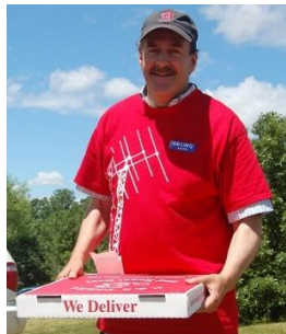
All non-KD1SM photos de K1NKR de Jim AB1WQ