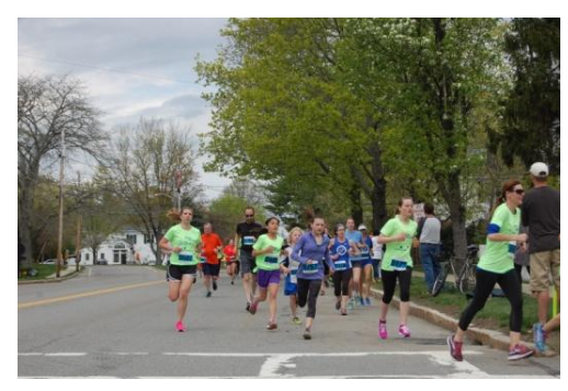
Runners approach post 8.