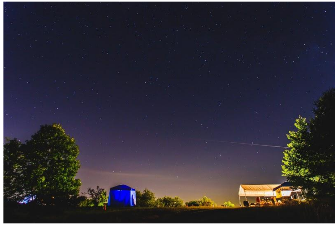
CQ Field Day de N1NC