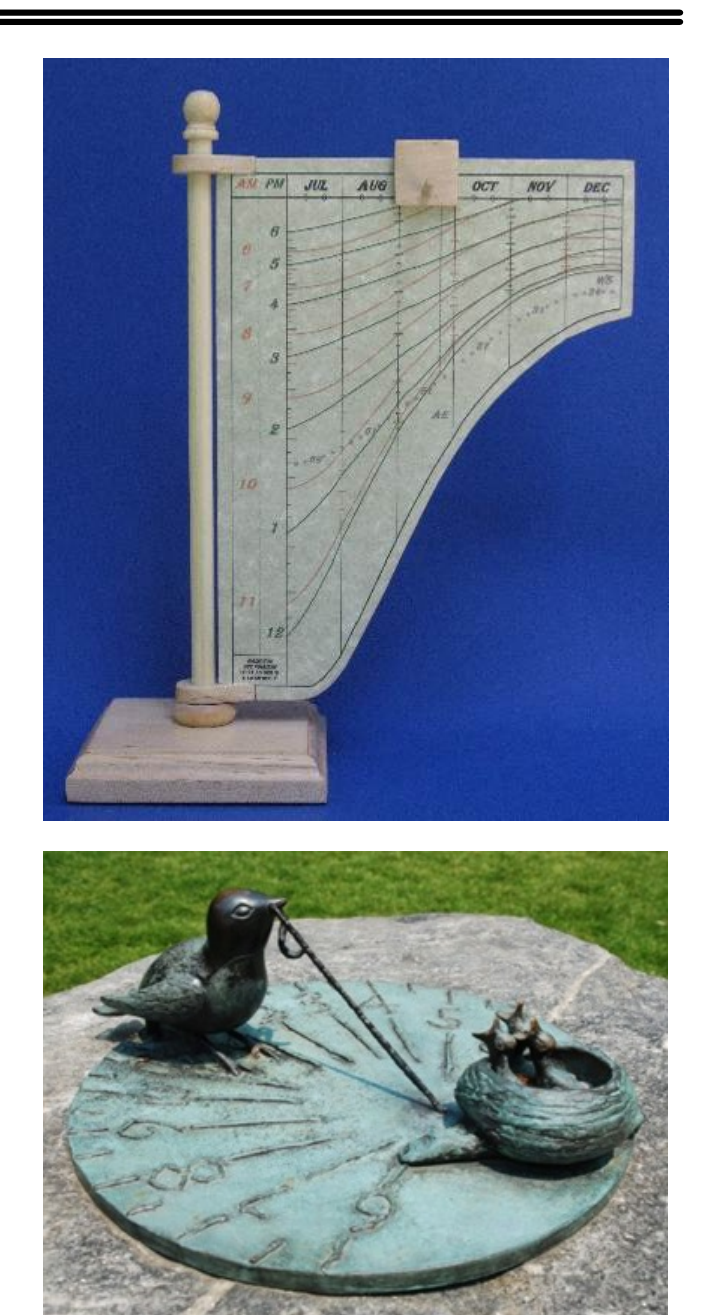
Above are some examples of sundials