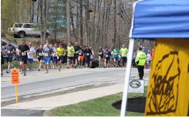
The 10K runners pass Net Control