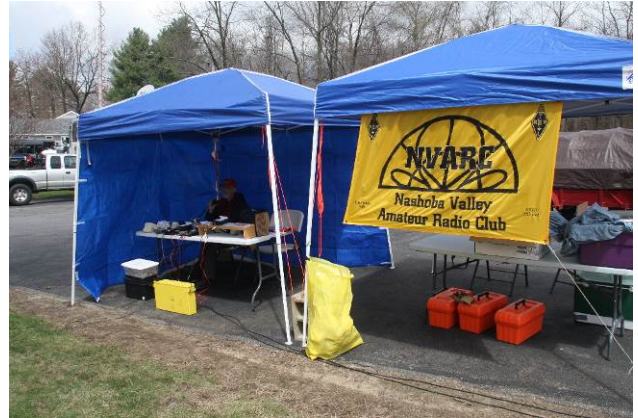
The Net Control and logistics tents