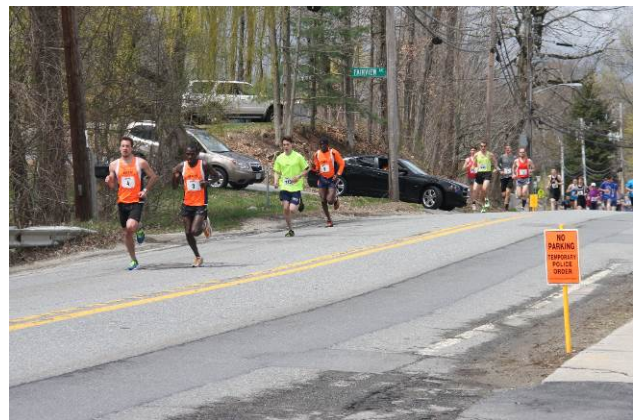
10K leaders pass Net Control