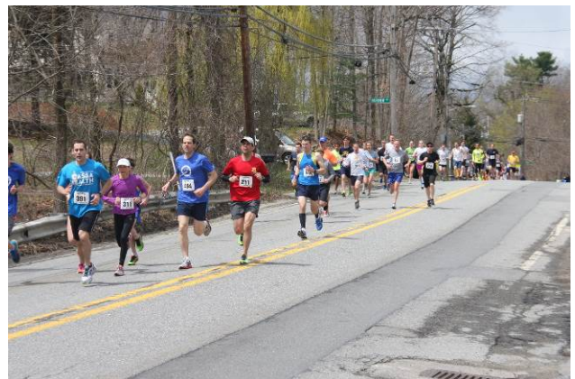
The 10K runners pass Net Control