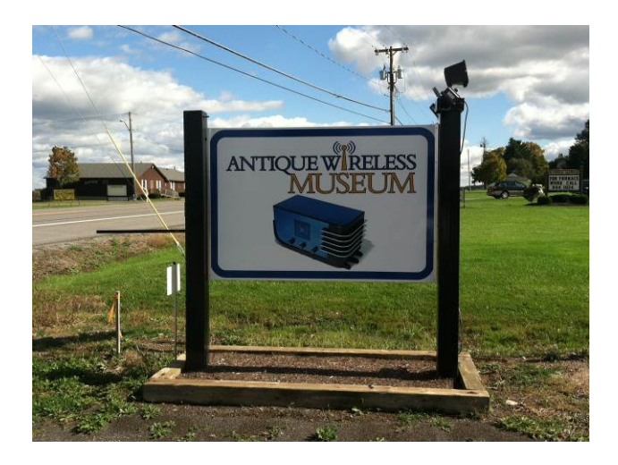
AWA Museum sign, prominent on NY Route 5&64 (US Route 20).