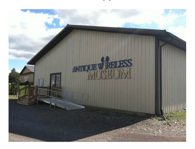
Headquarters and museum of the Antique Wireless Association, Bloomfield NY. (www.antiquewireless.org)

The ARRL website notes that this November marks the fiftieth anniversary of the Arecibo radio telescope in Puerto Rico. Heck, that's nothing. I bet there's more than one of our members who has an antenna that's more than fifty years old.