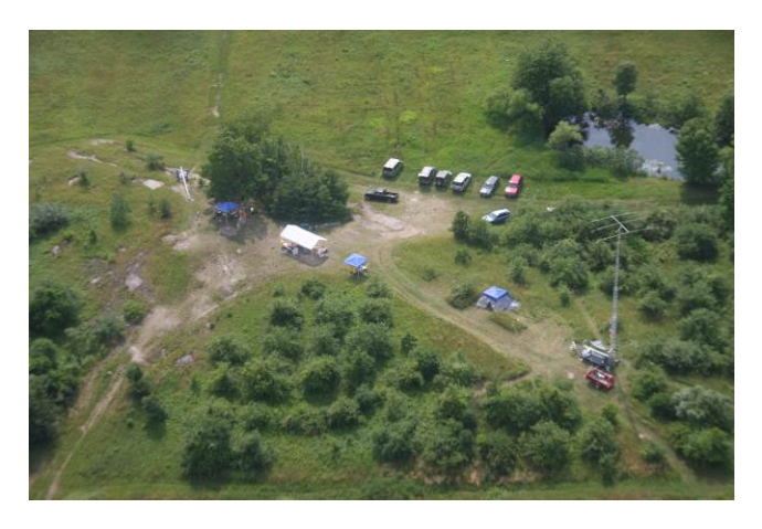
The Field Day site with the V/UHF upper left and the HF station and tower in lower right. The white food tent is upper center.

First, I would like all participants for making Field Day 2013 a fun and safe outing. Second, I must extend high honors to Roland NR1G for his past performance as Field Day Chair. He made it look so easy that I was lulled into a false sense of security, and make a few clear errors, but we worked around them.