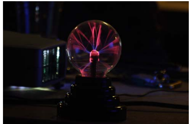
Stan and Bob even brought some bottled lightning