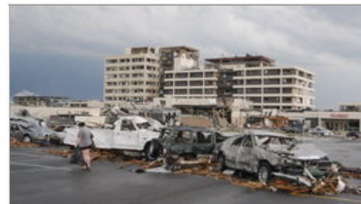
Damaged vehicles litter the parking lot of St John's Hospital in Joplin, Missouri, after a tornado hit the Southwest Missouri city on Sunday, May 22. According to reports, the tornado hit the hospital head-on.

On Sunday, May 22 at 5:41 PM, the single deadliest twister in almost 60 years -- and the second major