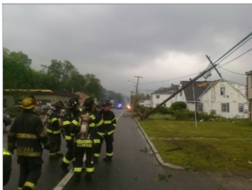
In Sturbridge, Massachusetts, state police officers survey the damage done by the tornado.

At least two tornadoes touched down in Central Massachusetts late in the afternoon on Wednesday, June 1.