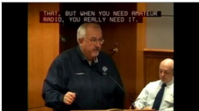
In an earthquake communications preparedness forum sponsored by the FCC, FEMA Administrator Craig Fugate praised Amateur Radio, saying "...when you need Amateur Radio, you really need it."

(USGS), FEMA, the FCC and the private sector. Fu-