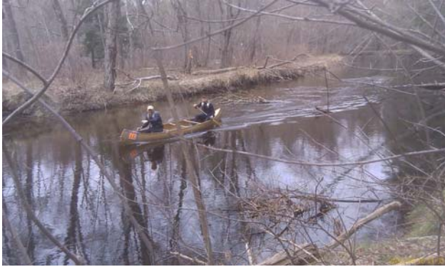
Two paddlers approach the the final portage on the river.