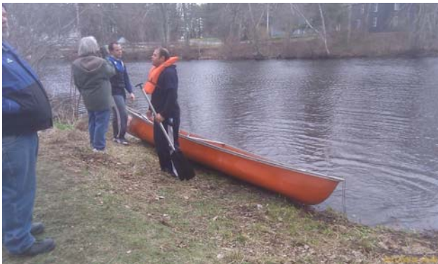
A pair of slightly chilly paddlers reach the finish.