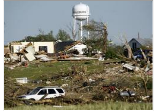
Hackleburg -- located in Marion County in Alabama's northwest corner -- suffered an EF-5 tornado last week that killed 30 of the town's 1400 residents. Hams from the ARRL's Northern Florida Section are in Hackleburg and Jasper (located in Walker County) to help provide communications support.