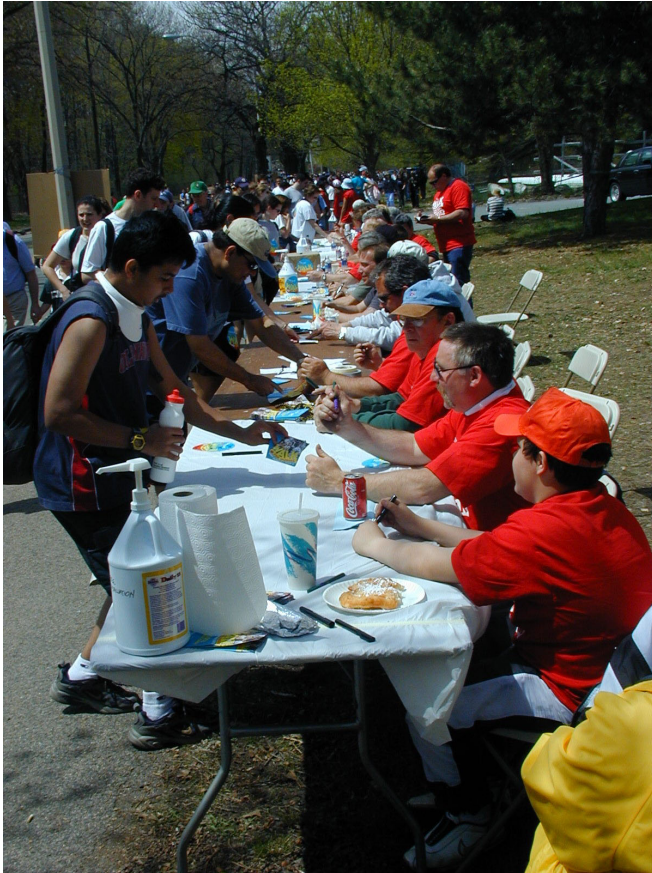
After the walkers “checked in” at Daly Field they passed a snack area where free drinks and snacks were distributed.