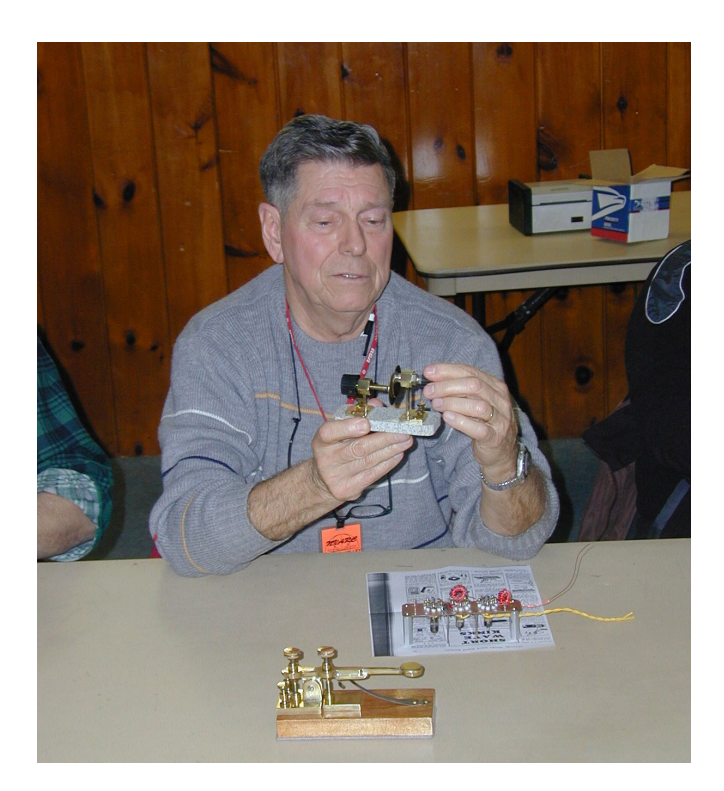
Earl also brought a pencil tube regenerative receiver he built (not shown) and the 1935 condenser used for tuning radios (shown above and below).