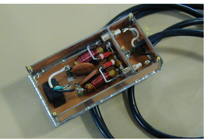
Bob W1XP brought a noise filter (above) he designed and built which mounts on the back of a standard PC power supply to reduce the noise that comes out on the power leads.