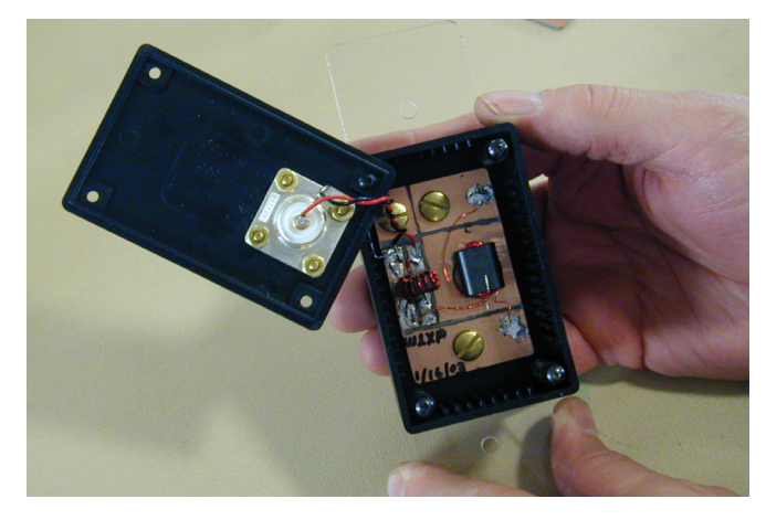
He also showed a beverage antenna matching transformer package he designed and built.