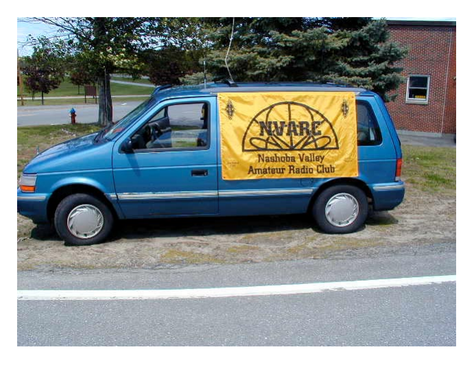
Above is the NVARC NCS transport vehicle.