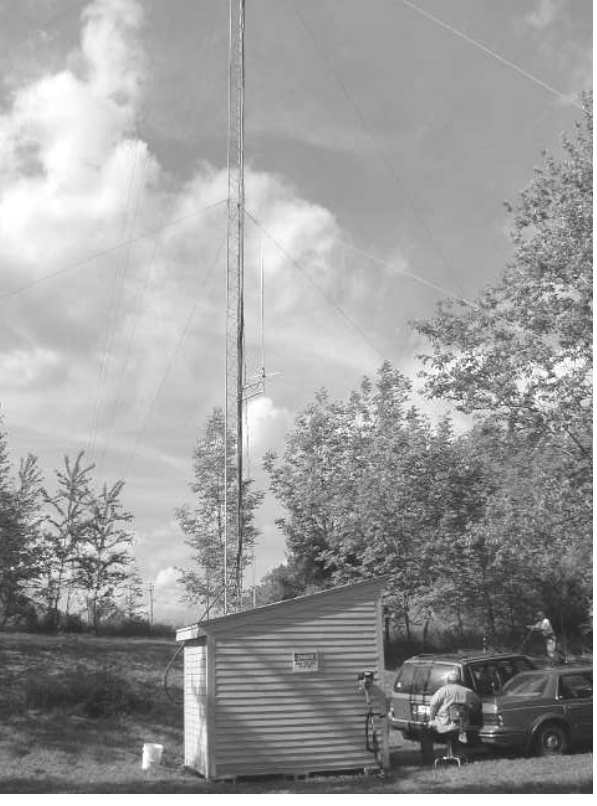
When all the technical stuff was completed they brought in the grounds crew to clean up and make