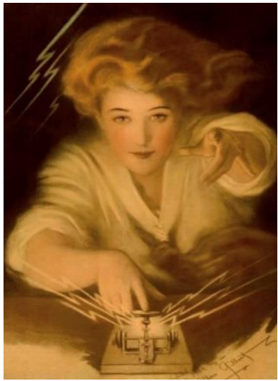
Have YOU paid your NVARC Dues? See: <u>http://n1nc.org/Members/Roster</u> for your renewal month.