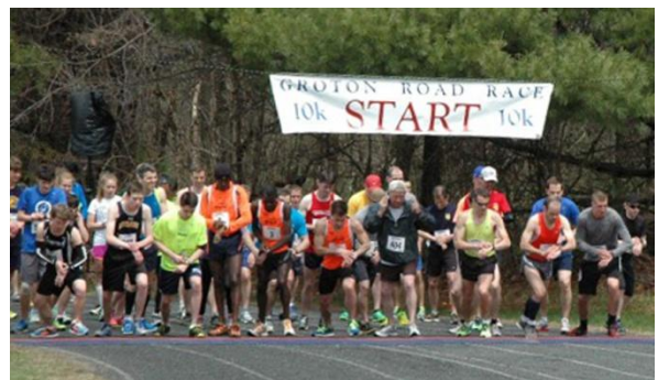
The Groton Line

After the snow and nor'easters the beginning of March I expect we are all relieved that warmer temperatures have started to appear this week. And that means, like the flowers, the Groton Road Race will be coming up soon.